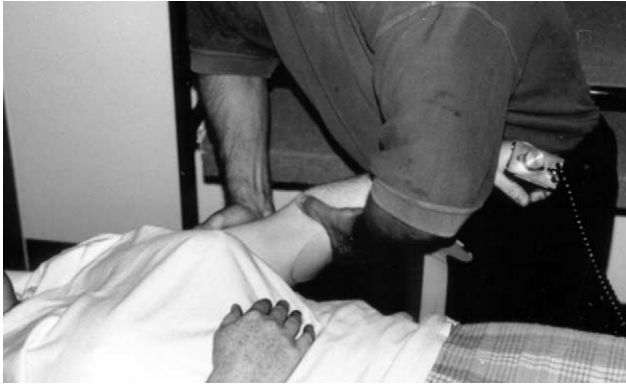
Fig. 1. The application of the mobilisation with movement lateral glide treatment technique with the flexible pressure mat in situ and the patient gripping the grip dynamometer.

directed glide to the medial aspect of the proximal ulna (Fig. 1). The subject was instructed to perform a pain free grip strength test while the glide was sustained. At the onset of pain the subject relaxed their grip on the dynamometer and the therapist then removed the manual force. The duration of each treatment technique application was no more than 10 s. The manual force applied to the subject's elbow was measured by a flexible pressure-sensing mat (EMED PEDAR, Novel, Munich, Germany), which was interposed between the therapist's hand and the subject's medial aspect of the proximal ulna (Fig. 1). This equipment has previously been used to measure forces during the application of spinal manipulative therapy techniques [13,14]. The PEDAR flexible pressure mat conforms to the contours of the subject's forearm while allowing the therapist to maintain a feel of the underlying body part, an important feedback mechanism utilised by manual therapists during the application of treatment techniques.