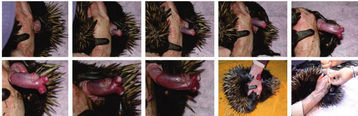
Figure 1: Erection and ejaculation resulting in semen collection in the short-beaked echidna. Note the progressive shutdown of the left side of the glans penis.

the engorged penis would appear to deliver the semen directly adjacent to the female's oviductal ostia. Ejaculation commences approximately 20 s after the penis has become fully erect. When erect, the penis was about one-quarter of the echidna's body length. Erection and ejaculation typically lasted between 10 and 15 min. During ejaculation, the semen pooled into the cups of the rosettes as a white viscous fluid (fig. 2A).