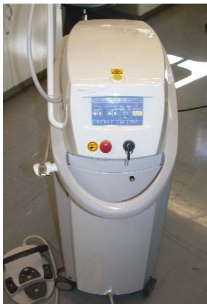
Figure 4. Er:YAG dental laser (KEY 3, KaVo, Germany).

Ozone (O 3 ) is a powerful oxidizing agent which neutralizes acids and its effects on cell structures, metabolism and microorganisms are well-documented in published papers in both dentistry and medicine. 9-11 Research has shown that ozone disrupts the cell walls of microorganisms (bacteria and viruses) within seconds, leading to immediate func-