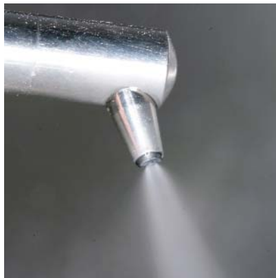
Figure 1. A KaVo air abrasion tip utilizing additional water spray for decreased patient sensitivity.