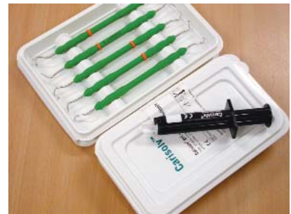
Figure 2. Use of mechanical hand instrumentation with Carisolv.

This utilizes a stream of small (27.5 micron diameter) aluminium oxide particles under air pressure to remove tooth substance by brittle fracture (Figure 1). It produces less