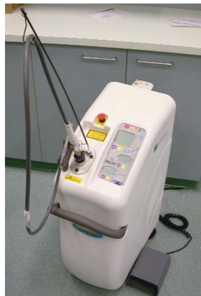
Figure 5. Er,Cr:YSGG dental laser (Waterlase, Biolase, USA).

Exposed root surfaces in aged individuals with gingival recession are more susceptible to caries. 12-13 The micro flora of primary root caries lesions has been shown to contain large numbers of acidogenic and aciduric microorganisms, which correlate with the severity of root caries. 14-18 Ozone can now be considered as a clinical alternative management strategy for root caries, and this statement is well supported in the increasing volume of published research on this topic. Reversal of primary root caries lesions is associated with remineralization and a corresponding reduction in acidogenic and aciduric micro-organisms. 19,20 This research has